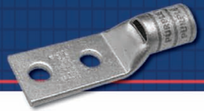
Two Hole HYLUG™ Flex Conductor Standard Barrel with Inspection Window