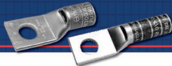
One Hole HYLUG™ Code Conductor Standard Barrel with Inspection Window