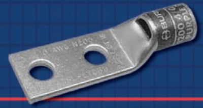
Two Hole HYLUG™ Code Conductor Standard Barrel with Inspection Window